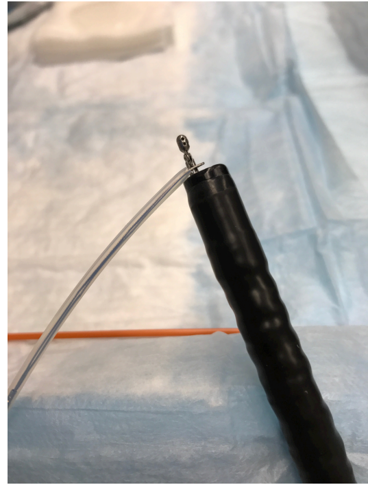
Figure 1: Demonstration of the Endoscopic Snare Secured to the End of the Endoscopic Forceps.

Care must be taken to ensure the tip of the endoscope